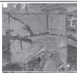
Tract 2 / Lot 3 Dreamway Drive