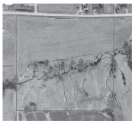
Tract 1 / South of Middle Road